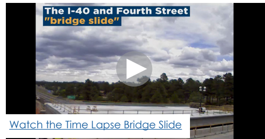
Watch the Time Lapse Bridge Slide