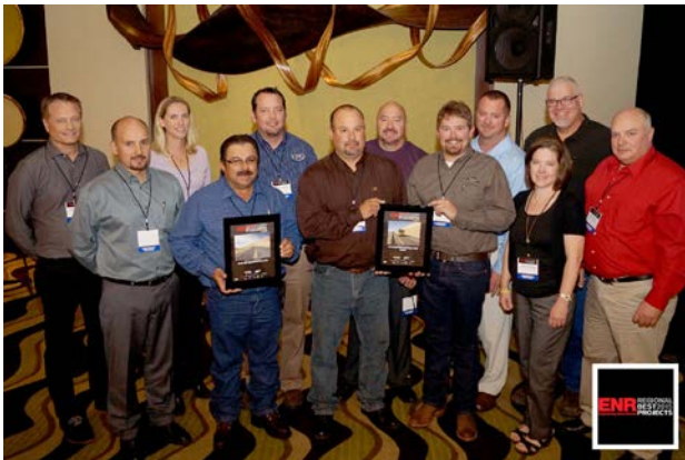
LtoR: 89 Slide CMAR team; Sacaton ABC team

The awards were received at the ENR Southwest Renaissance Phoenix Hotel in November. ENR's annual awards program is dedicated to honoring the best construction projects and the companies that designed and built them within the U.S. and Puerto Rico. Projects compete in 20 specialized categories, ranging from airports to sports/entertainment.